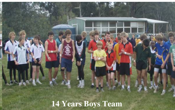
14 Years Boys Team