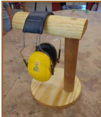
Declan Bren's Headphone Stand