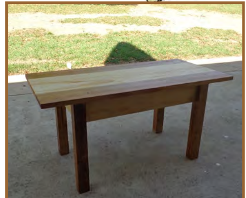
Rikki Arnol's Coffee Table