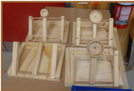
Left: Year 8 catapults